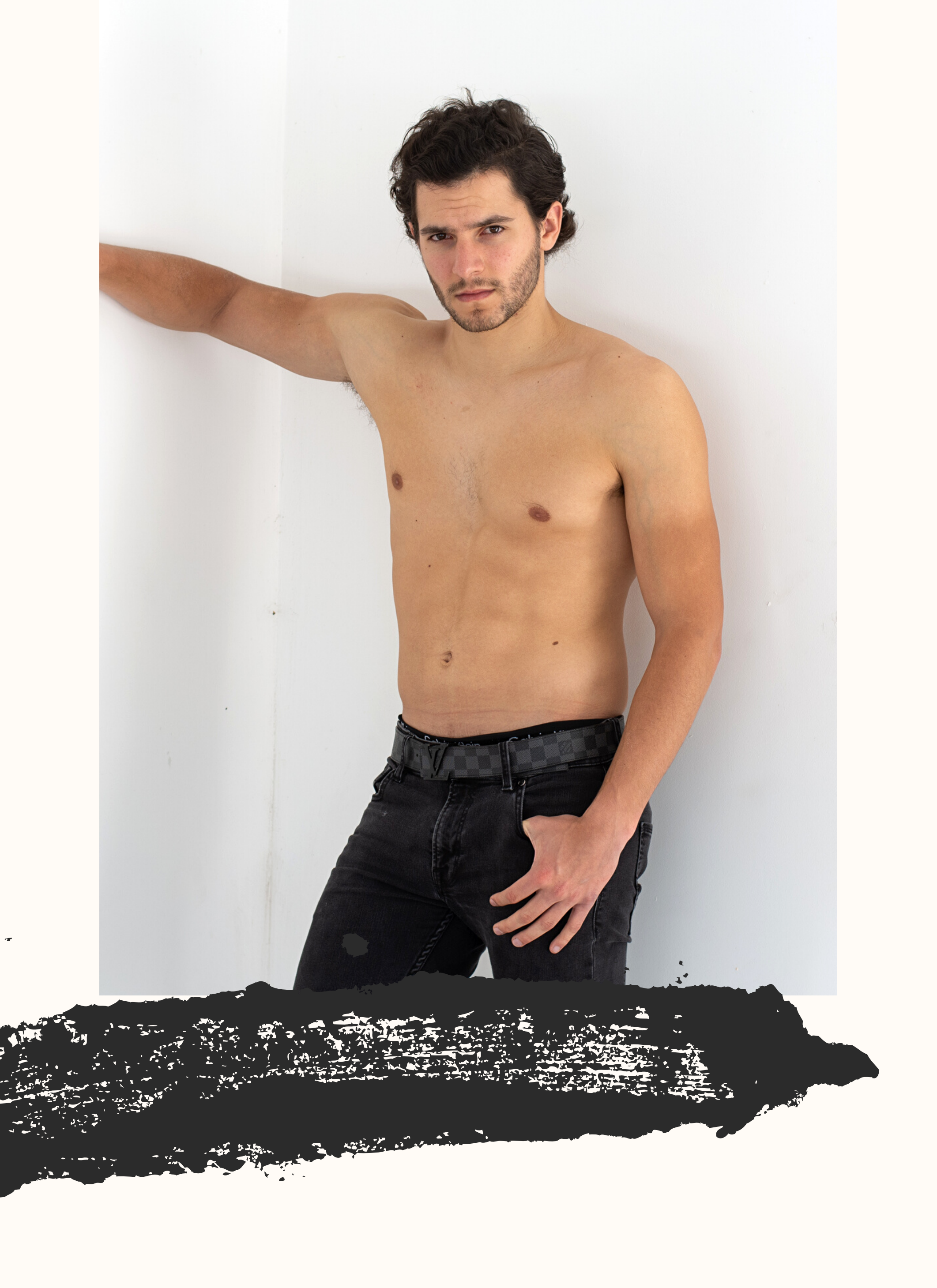
Almost all agencies want a standard full-body shot, a quarter-turn shot from various angles, and a close up face shot. These images should be in a relaxed pose for a natural look.